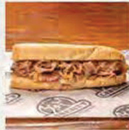
The Original $8.00 - $11.25