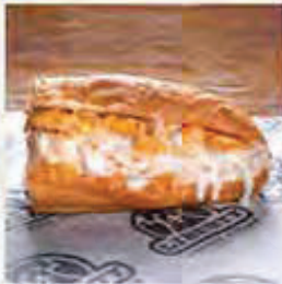
Buff Chick $9.50 - $13.25