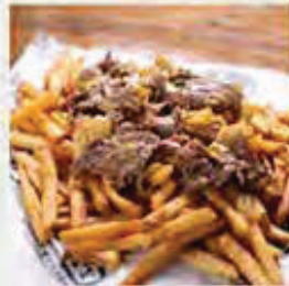
Steak Fries $12.50