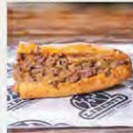
The Wiz $9.00 - $12.75